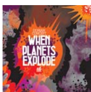
DORIAN CONCEPT WHEN PLANETS EXPLODE (KSNN8CD-LP)