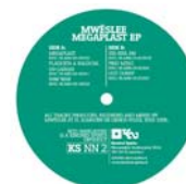
MWESLEE MEGAPLAST E.P. (KSNN2-12)